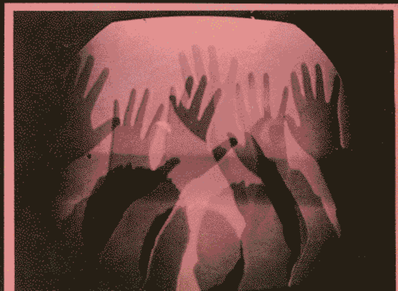
Participation No. 1 by Nam June Paik